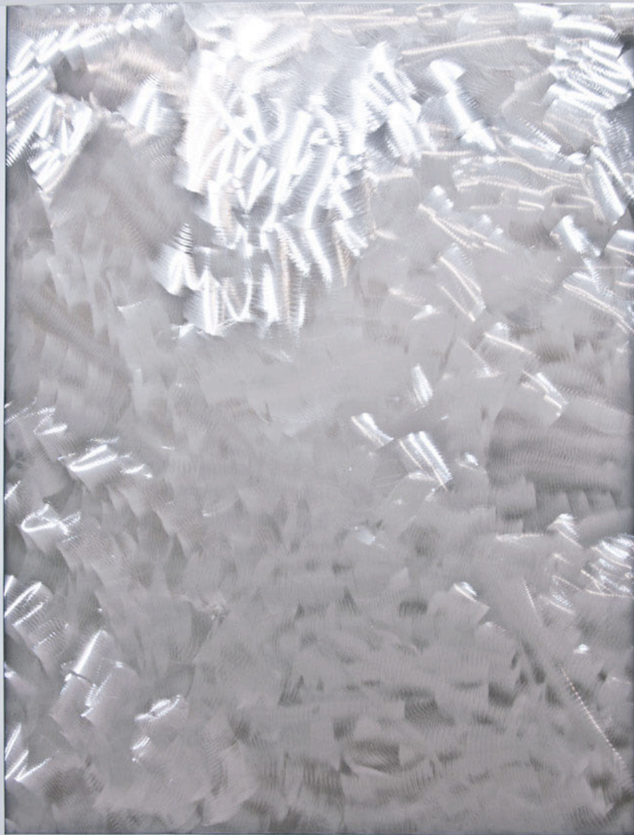
Magali Reus Noise (Signal White) 2012 Aluminium, spray paint 119x92x0.5 cm