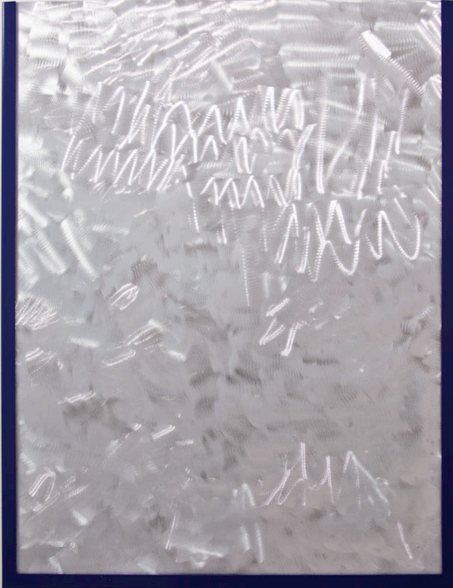
Magali Reus Noise (Night Blue) 2012 Aluminium, spray paint 119x92x0.5 cm