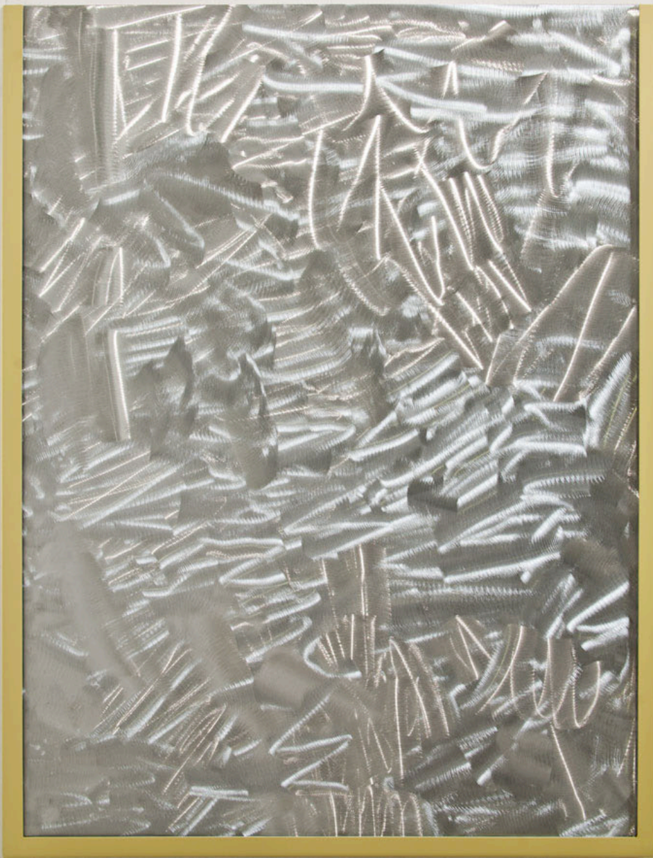
Magali Reus Noise (Cream Yellow) 2012 Aluminium, spray paint 119x92x0.5 cm